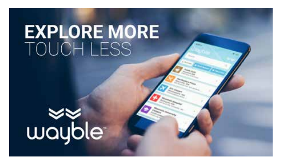
Hero Image w/ Headline and Logo Use when not accompanied by an article or supporting context