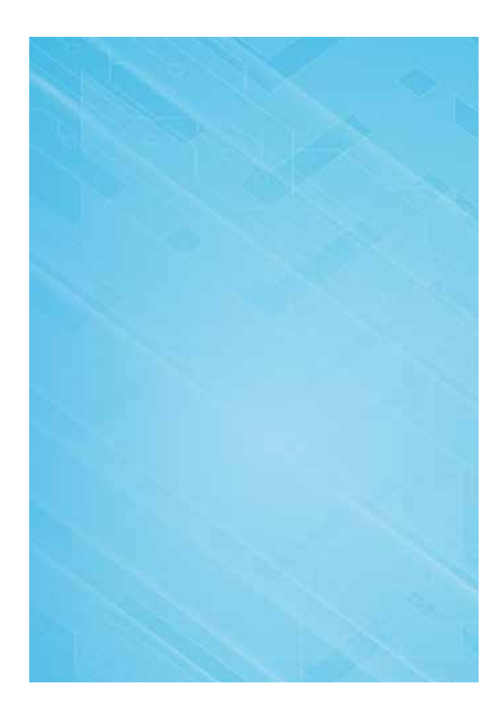
Wayble Chevron Brand Background

The Wayble chevron pattern background can be used when a background is required