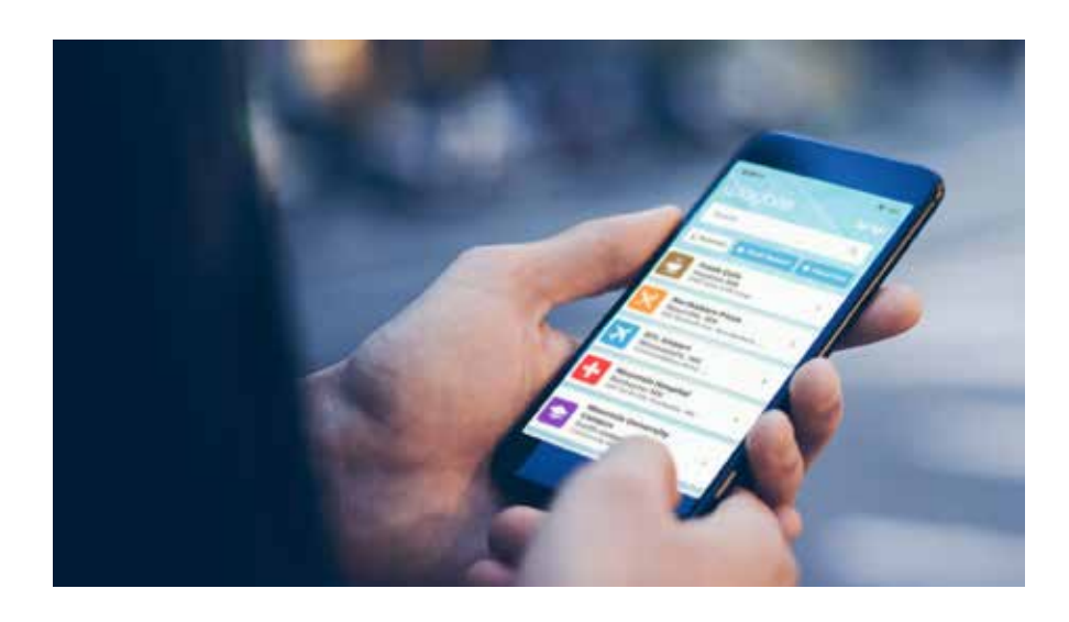
Hero Image - No Text or Logo Use when accompanying an article or supporting context